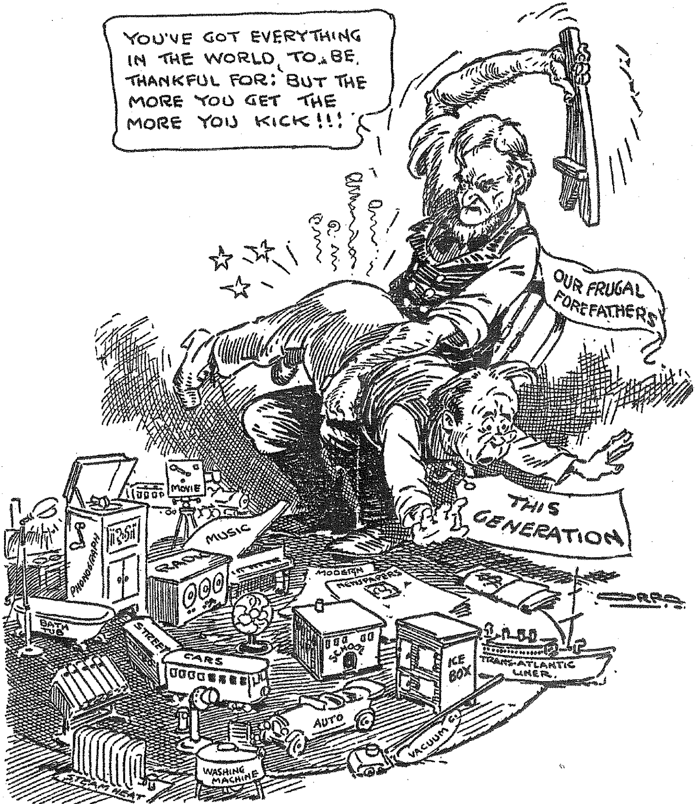
Document 2. Cartoon, Chicago Daily Tribune, August 23, 1924. Copyrighted ©, Chicago Tribune. Used with permission. [National Archives]

(Copyright: 1924: By The Chicago Tribune.)